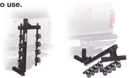
Arms fold down.