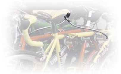
Integrated locking cable.